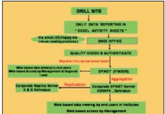
Fig.2 : Data flow for well data under current data management

Activity wise Spreadsheets were created and finalized in association with specialist group, drilling and logging services. A sample Spreadsheet is shown in Fig. 4. Data was mapped to Finder and xml based spreadsheet loaders were created for each activity. The activities covered in spread sheet and a sample xml loader are included in Table-1 & 2 respectively. The entire job of creation of loaders was carried out in-house. Appraisal and hands on training was provided to identified manpower. A program for generation