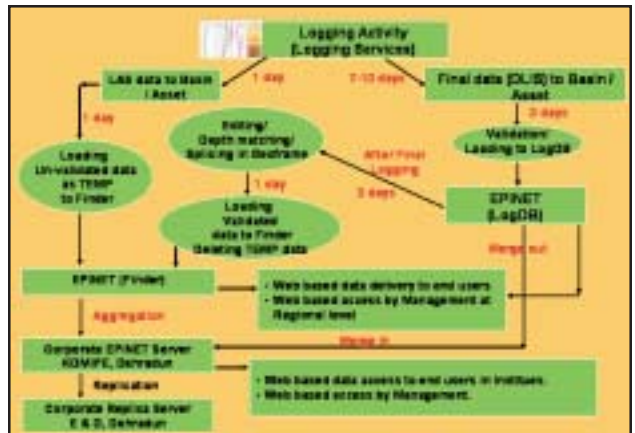
Fig.3 : Data flow for log data under current data management

for Daily Geological Report from same Spreadsheet was also developed and implemented. A web based program for management reporting was developed and implemented at all sites.